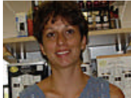
image. This month we high-light 2 more of our talented staff members:

a gifted eye for beauty, and skilled in all areas of her craft.